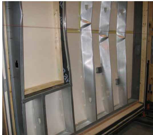
Grace air barrier systems withstood wind gusts equivalent to 168 mph, remaining fully-adhered and intact while substructure was brought to failure.

After successfully completing the ASTM E 2357 testing on the air barrier assemblies, Grace chose to subject the assemblies to extreme wind loading beyond the requirements of the test. The Perm-A-Barrier air barrier assemblies withstood the equivalent of 168 mph wind gusts, air pressures of 72 psf (3445 Pa), before allowing air leakage through the assembly. The dramatic photo above shows how the steel studs, steel fasteners and gypsum sheathing were brought to failure prior to the air barrier assembly finally giving way and allowing air leakage. This is proof positive that Grace Air Barrier Assemblies provide an air barrier solution for real life air barrier conditions.